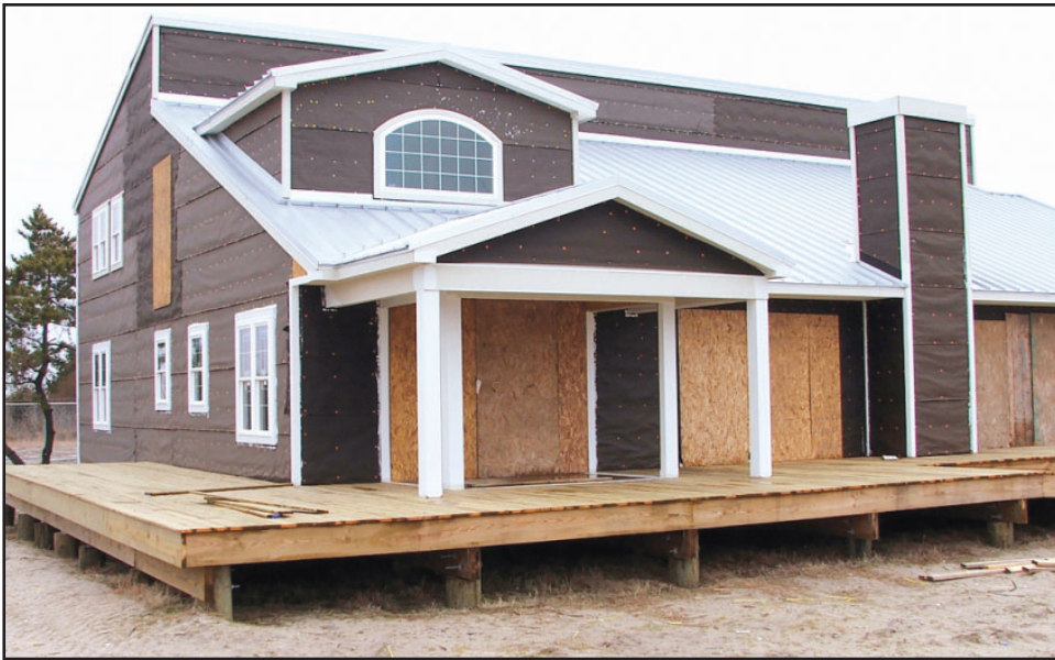
The new Center for the Inland Bays is under construction.

News from the Delaware Center for the Inland Bays