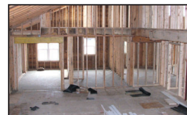
An interior view of the new CIB building.

4th Annual Governor's Wade-In Event Saturday, June 18 11 a.m. Towers Road Parking Area (bay-side)