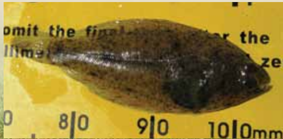
Juvenile Winter Flounder

To volunteer for the program or receive additional information check www.inlandbays.org or send an email to seiningisfun@hotmail.com