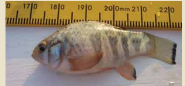
Adult Sheepshead Minnow