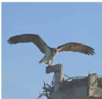
Osprey Bird Walk Learn about these iconic birds of prey that migrate to the Inland Bays each year to breed!