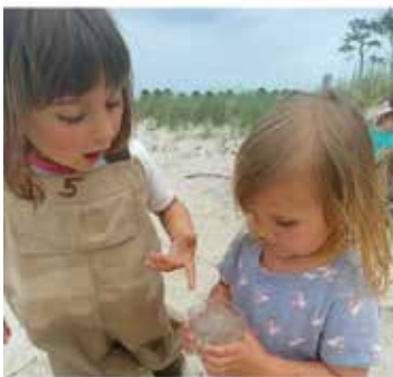
Kids Day at the Preserve New topic and hands-on activity each week...hiking, bay exploration, and more!

FREE public education programs at the James Farm Ecological Preserve