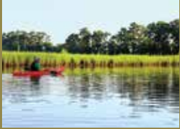
Clean Water for All, page 4