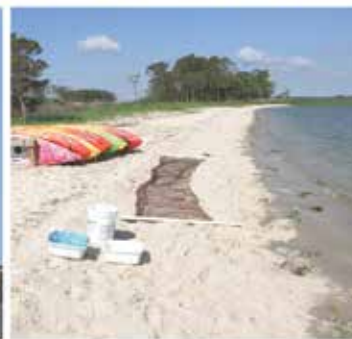
Discover the Bays Enjoy a hike down to the beach followed by a guided exploration of the Inland Bays tidal flats!

Visit www.inlandbays.org for program calendar updates!