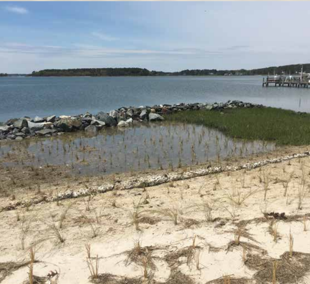
Completed planting of both marsh and dune grass species.