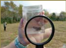
Student Scientists "Get their Feet Wet" at the James Farm Ecological Preserve, page 6

The Inland Bays Journal is a publication of the Delaware Center for the Inland Bays. The CIB is a nonprofit organization and a National Estuary Program. The purpose of the Inland Bays Journal is to educate and inspire people about this estuary of national significance and its restoration.