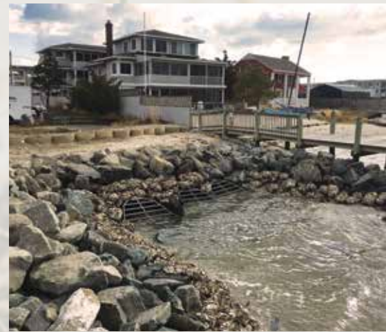
New outfall pipes fitted with tide gates.

To protect the future of its economy and quality of life, the Town of Dewey is partnering with the Center to plan and implement a series of green infrastructure projects that will reduce flooding and also improve water quality in Rehoboth Bay.