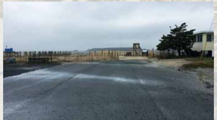
Read Ave. after 1.32" rainfall with no surcharge flooding - evidence that the tide gates are working!

An innovative aspect of this living shoreline project is the use of HESCO flood barrier boxes to serve as a stable spine for the low dune. These are collapsible wire mesh containers lined with heavy duty fabric, filled with sand and planted with beach grasses. If dune sand is washed away during a large storm, the HESCO barriers will maintain the integrity of the dune and its flood control function.