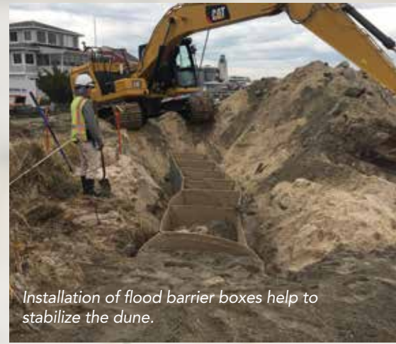
Installation of flood barrier boxes help to stabilize the dune.