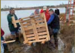
New Real Estate for an Osprey Pair, page 5