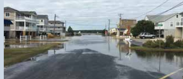
Flooding on Read Ave. prior to project construction.

Located on a narrow strip of land between the ocean and Rehoboth Bay, the town's low elevation and high percentage of land covered by pavement, buildings, and other impervious surfaces make it particularly vulnerable to impacts from coastal storms and sea level rise. Shorelines are eroding, and many areas experience frequent flooding due to stormwater runoff, high tides, and storm surges. Residents often find access to their homes cut off by floodwaters.