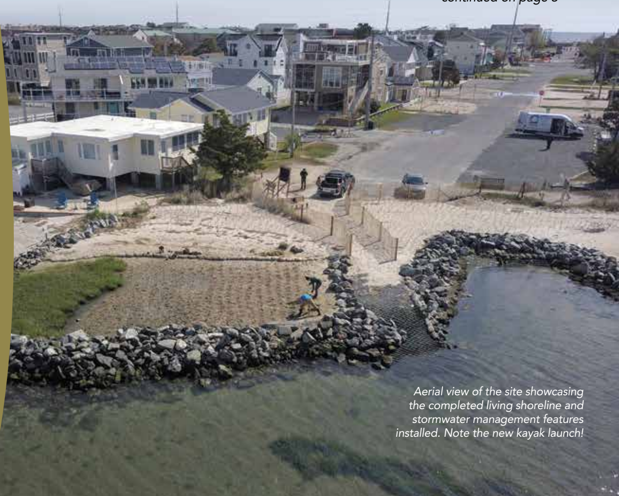
Aerial view of the site showcasing the completed living shoreline and stormwater management features installed. Note the new kayak launch!